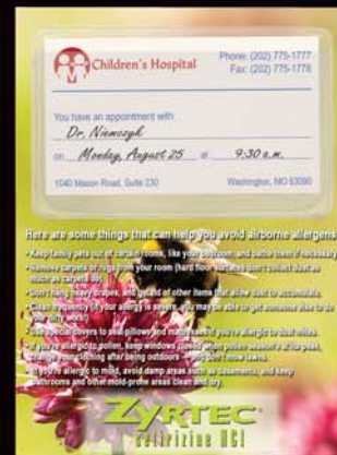
MP01FCC Allergy Awareness Magnet with Pocket