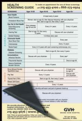
MNT02_C Health Screening Guide Magnet Pad