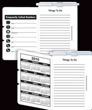
LM24FCAS (open) Frequently Called Numbers LM24FCBS (open) Calendar