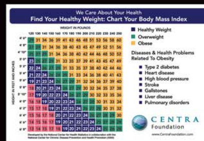
S233FCA Body Mass Index Magnet