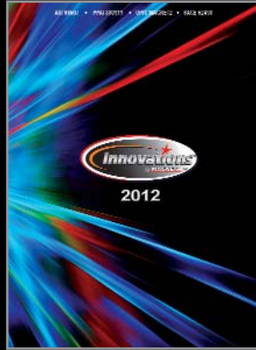
asi 68507 ppai 330919 upic MAGNET2 sage 52498