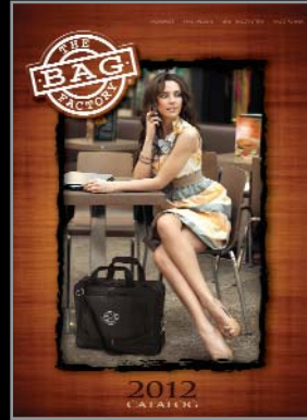
asi 68507 ppai 260424 upic BAGFACTRY sage 52498