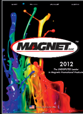
asi 68507 ppai 112424 upic MAGNET sage 52498