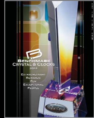
asi 68507 ppai 111438 upic BENCHMRK sage 52498

Scan these codes with your smartphone for instant access to this catalog!